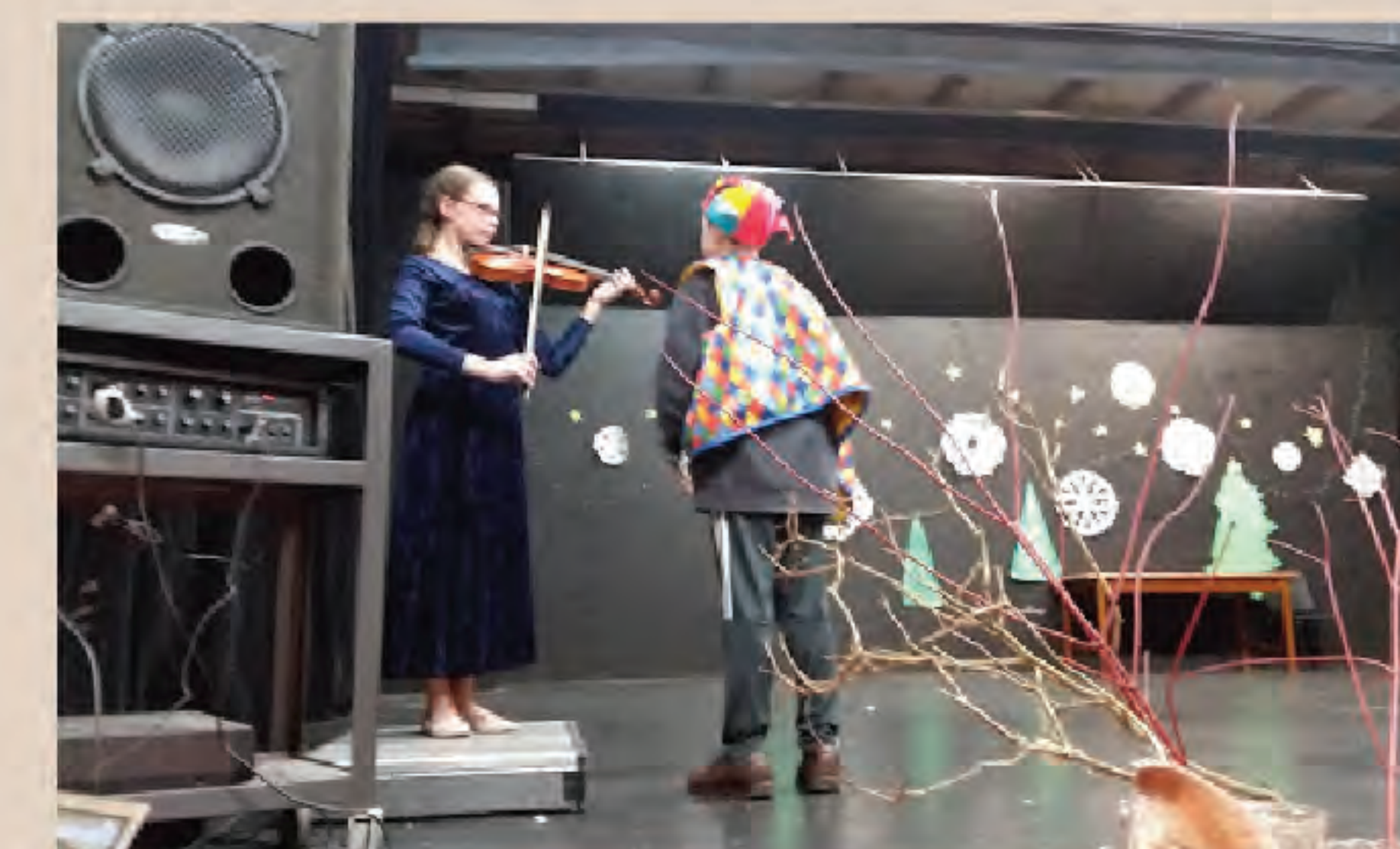
Music to accompany feast