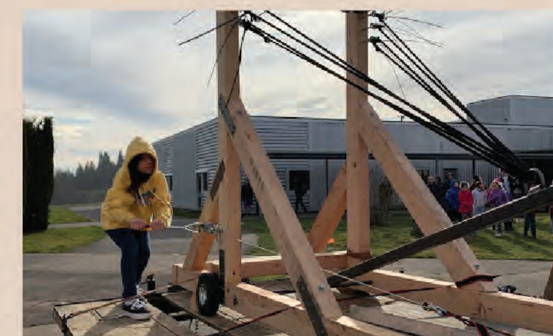
Launching the catapult