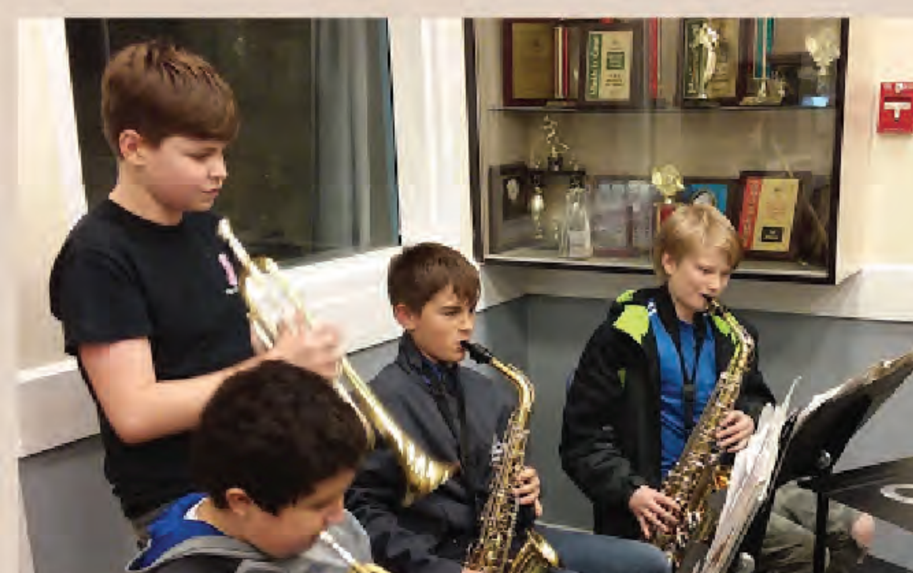
Music to accompany festival