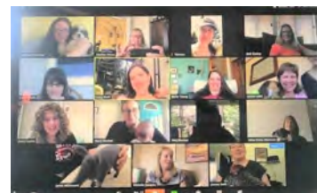
Staff Zoom meeting