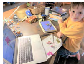
Edwin Young studies flowers